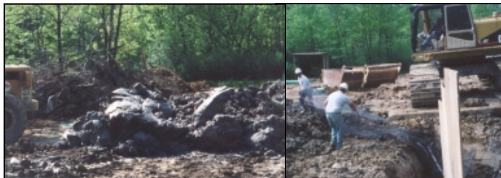
Marshy soil is removed. Haydite expanded shale lightweight aggregate, geotechnical grid and geotechnical fabric are incorporated to provide stability.