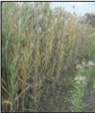
Bioswale using free-draining lightweight aggregate as planting medium

Rotary kiln produced ESCS structural lightweight aggregate is an environmentally friendly product that saves material, labor and transportation cost, as well as improves the performance and service life of concrete and other products made with it. Additionally, using lightweight aggregate will lower the overall energy consumption of structures thereby reducing the associated life cycle costs throughout the structure's useful life. These benefits support sustainable development and contribute to projects becoming LEED ( Leadership in Energy and Environmental Design ) certified.