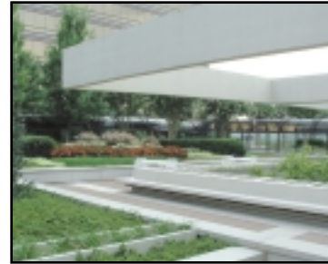
Intensive Roof Garden, North Park 400, Atlanta, GA