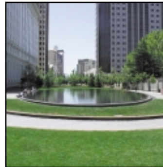
Garden and pool over Main Street Plaza parking structure, Salt Lake City, Utah

When viewed from an overall perspective, the utilization of ESCS lightweight aggregate is a significant and important step forward. The lightweight aggregate industry acknowledges that for the successful achievement of truly sustainable development, a fundamental shift in attitudes, beliefs and conscious behavior must take place. Considering the fact that architecture (building performance) accounts for a major part of total U.S. energy consumption, initial cost should no longer be the sole determining criteria when evaluating the usefulness of a product or structure. All construction materials must be evaluated from a total life cycle assessment. This is the only way to determine the total impact of a product or structure. To develop a sustainable world we must shift from our current short-term ways and attitudes, and embrace a long-term, holistic mind-set that recognizes performance and the interdependence of all life.