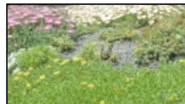
Sedums growing in SOILMatrix lightweight aggregate medium