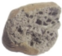
Structural lightweight aggregate particle showing interior voids

ESCS structural lightweight aggregate has been successfully used for well over two millennia. It has had widespread use for the past eighty years. This track record of proven performance has demonstrated how ESCS contributes to sustainable development by conserving energy, lowering transportation requirements, maximizing structural efficiency and increasing the service life of structural concrete, concrete masonry, and asphalt chip seal. The use of lightweight aggregate in site development assists designers in addressing the important issue of storm water management by making on-site treatment a viable option. ESCS can help to reduce heat island effects by amending soil to improve landscaping and making the use of “green roofs” not only desirable, but economically feasible.