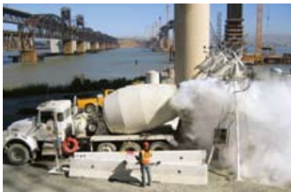
High cementitious materials content created high heat of hydration, so the contractor used liquid nitrogen with a wand to cool the concrete inside the trucks.

'The key to achieving the extra span length and satisfying lifeline structure criteria was the use of lightweight concrete.'