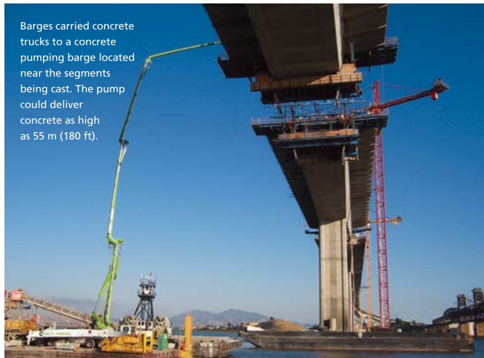
Barges carried concrete trucks to a concrete pumping barge located near the segments being cast. The pump could deliver concrete as high as 55 m (180 ft).